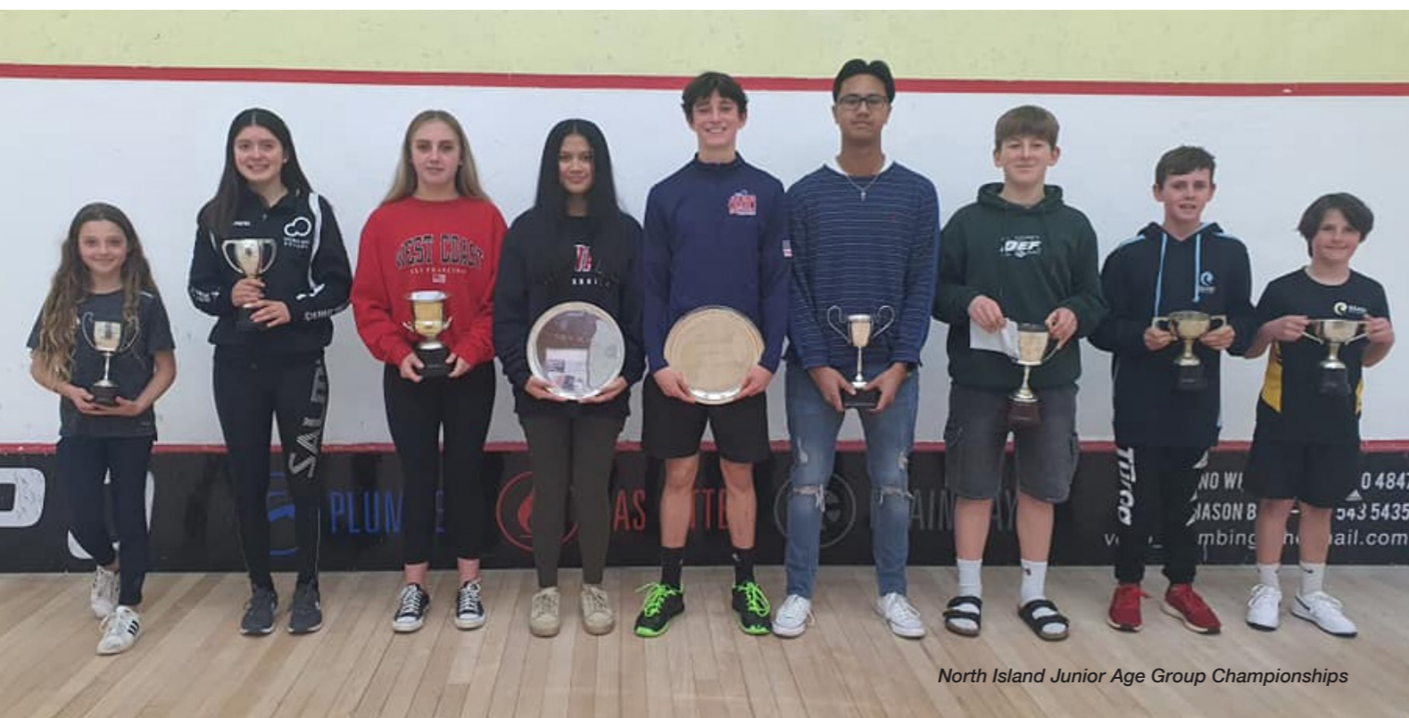
North Island Junior Age Group Championships